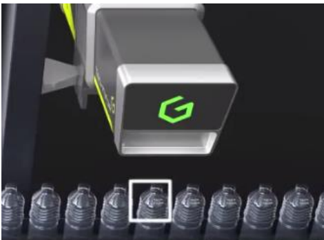
« On-the-fly » kit