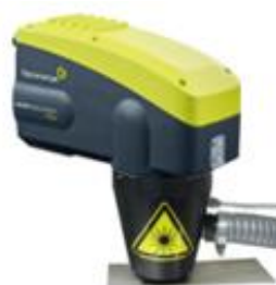
MINI-IN-LINE Class 1 Nozzle cap protection